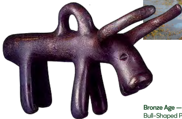
Bronze Age — First Depiction of a Domestic Animal — Bull-Shaped Pendant, ostava Poljanci I, 13th—12th Century BCE